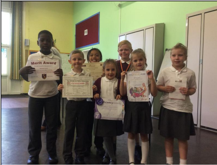
Our Out of school achievement winners!