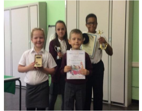
Out of School Achievements