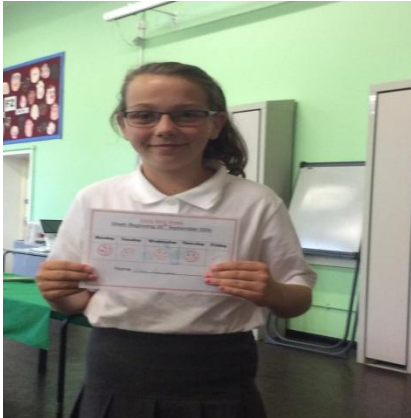
Early Bird Winner