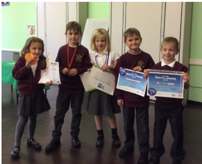
Out of school achievements.