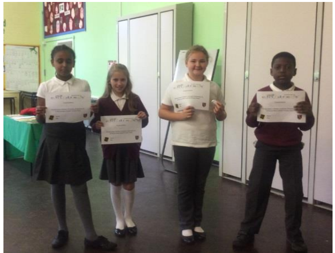
Children's University Ambassadors.