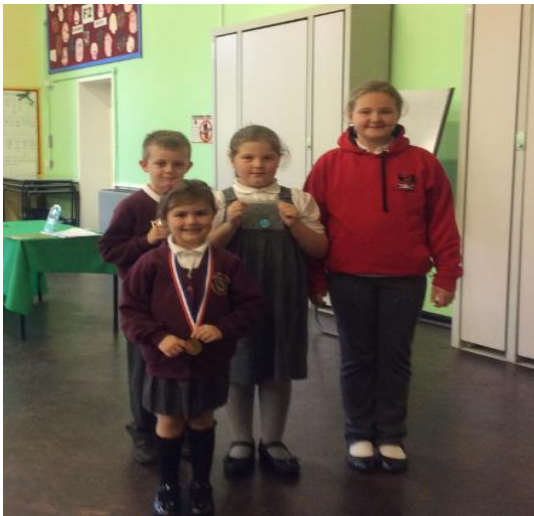
Out of school achievements.