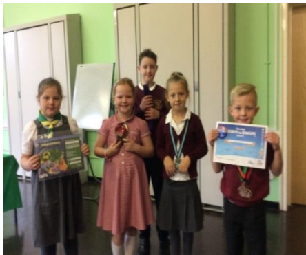
Out of school achievements.