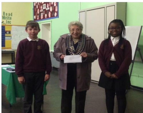
DONATION RECEIVED FROM ECCLESFIELD PARISH COUNCIL AT MERIT ASSEMBLY .