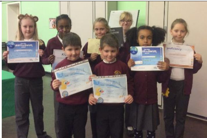
Out of school achievements