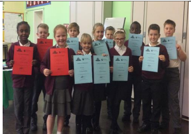
Sheffield United Football Competition Participants