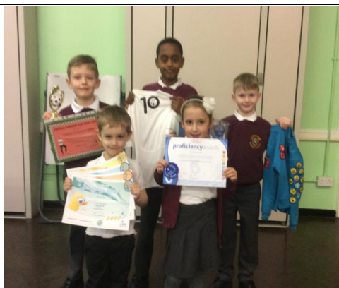
OUT OF SCHOOL ACHIEVEMENTS