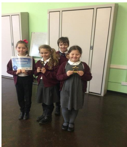
Out of school achievements