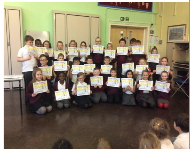
Y4 swimming certificates