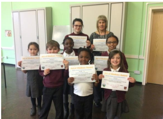
Act of kindness week.