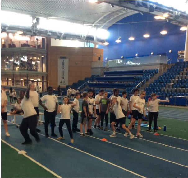
Year 6 Trip to Sheffield Institute of Sport- Great effort Year 6!