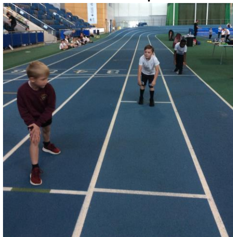
Year 2 Trip to Sheffield Institute of Sport- Well done Year 2!