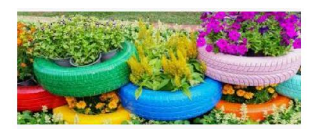
Tyre planter club!

As part of our improvements to the nature garden, we would like to add some tyre planters to attract wildlife and add some much needed colour to that area of school.