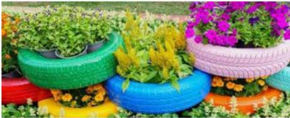
Tyre planter club!

You need to enter the school grounds by the main gate only but when leaving the school grounds you may leave by either the main gate or the side gate via the far footpath. This system is in place to keep our children safe and to stop congestion at the small gate, so can we please ask that you keep to these systems. Thank you for your support.